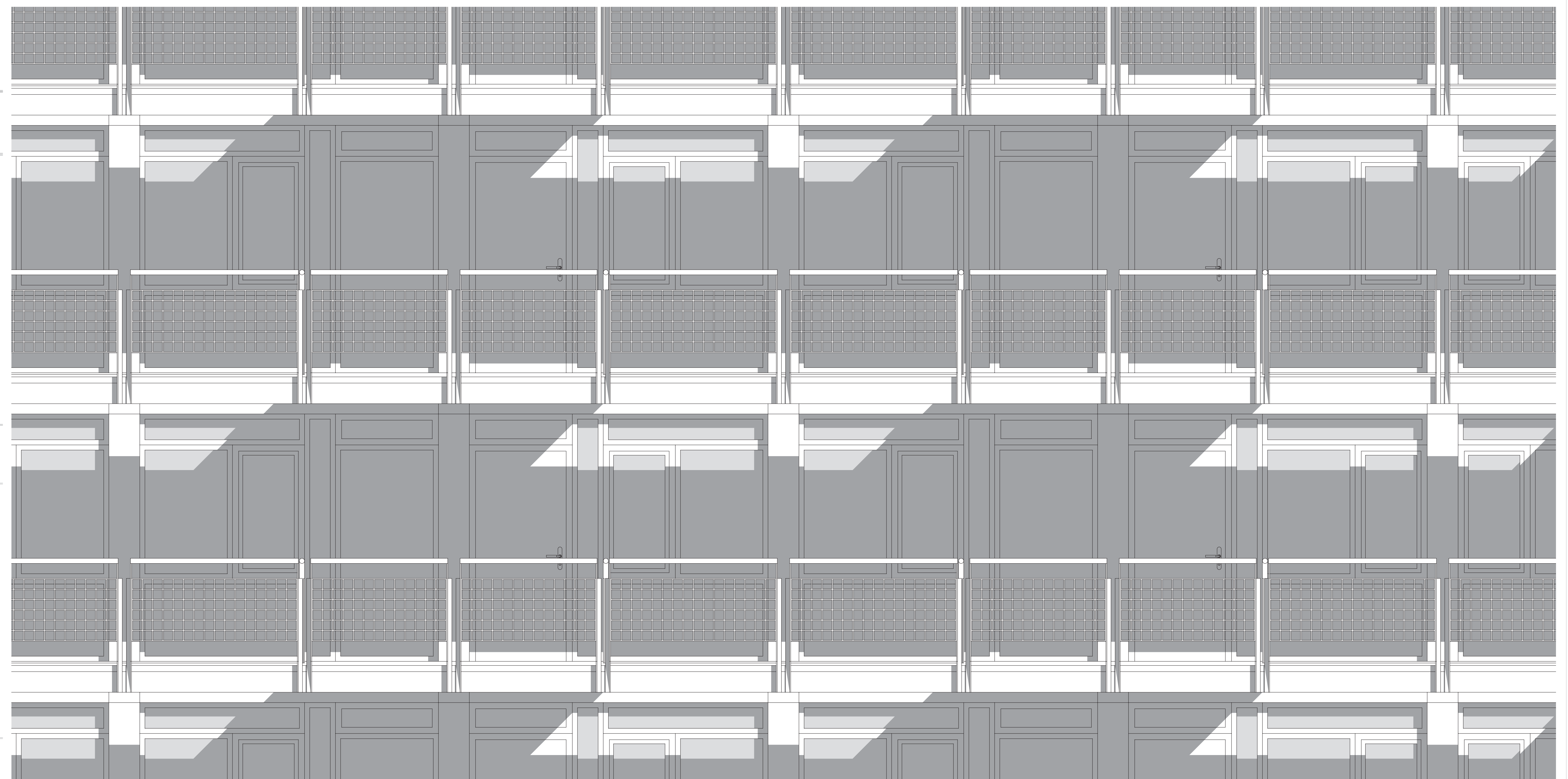
Façade ouest 1:20